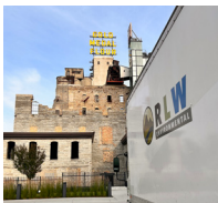
Commercial & Residential