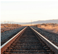
Rail Yards & Derailments