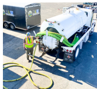
Fuel Islands & Transport Hubs